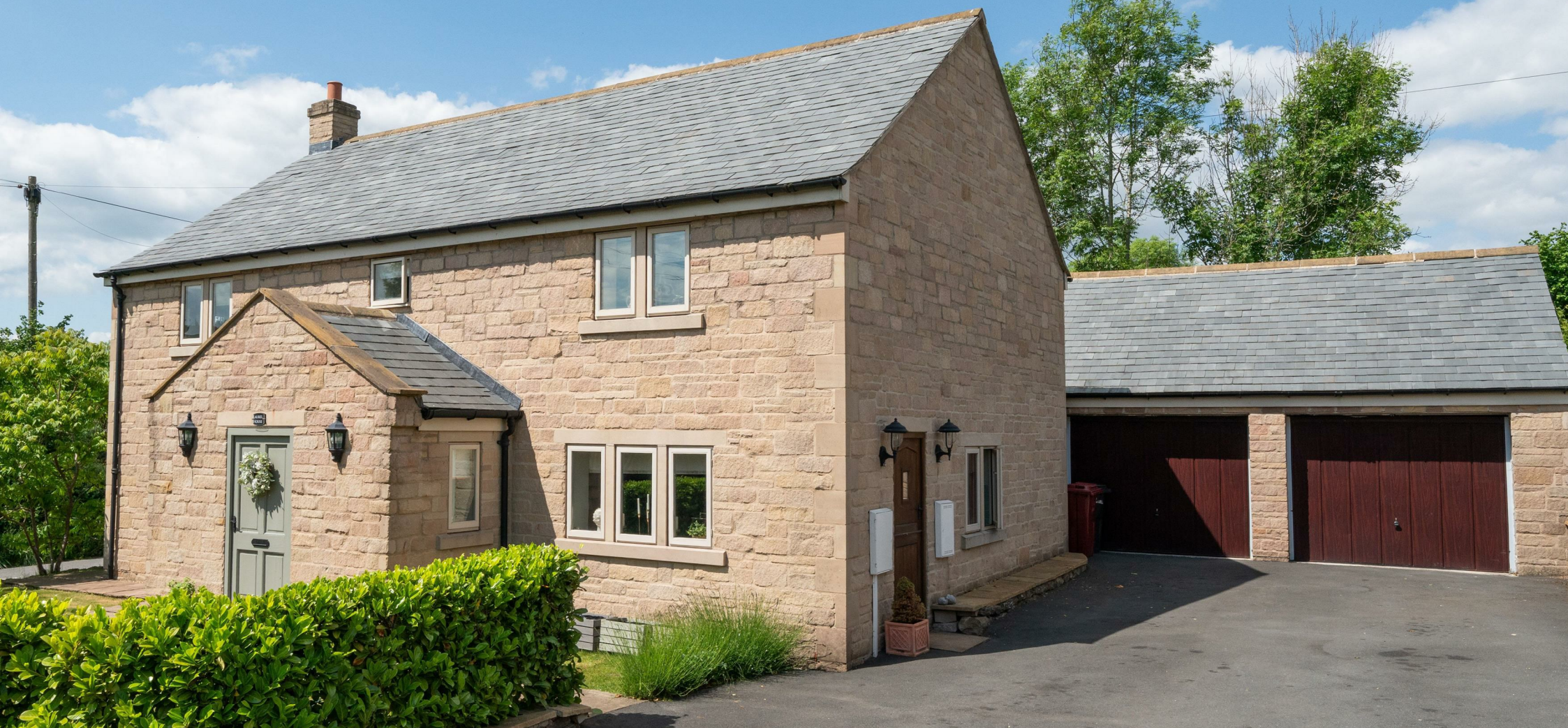
Laurel House Hard Meadow Lane Ashover, Chesterfield, S45 0ES £2,250 PCM